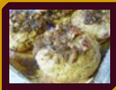
Phantom Rhubarb Muffins

1/2 cup sour cream 1/4 cup vegetable oil 1 large egg-beaten 1 1/3 cups flour 1 1/2 cups diced rhubarb 2/3 cup brown sugar 1/2 teaspoon baking soda 1/2 teaspoon salt