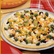
VEGGIE PIZZA from Carolyn's kitchen

1 tube Jumbo Pillsbury Crescent Rolls 1 cup thick sour cream 1 clove garlic 1 envelope taco seasoning 1 cup chopped broccoli 1 cup chopped cauliflower 1 large carrot chopped 1 small green pepper 4 plum tomatoes cheese